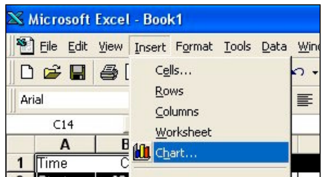
Figure 2: The Data is highlighted and the 'Chart' option is selected